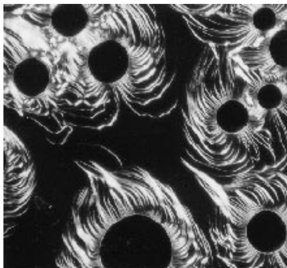
Fig. 1 Polarized optical micrograph of the TGBA phase on heating to 143.8 °C; magnification \times 100

dipolar regions of the core. The phase assignments and transition temperatures (°C) of 8 shown below were determined by polarized optical microscopy using clean, untreated glass microscopic slides and cover slips as well as by differential scanning calorimetry (DSC) measurements.